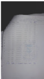
UNiv COmm 25 & 75.jpeg 89K